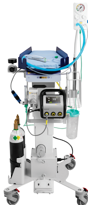
AlphaCore 5 Patient Warming System in conjunction with LifeStart ™

This technology provides a simple, effective and affordable solution for all these clinical environments and for the active mitigation of potential inadvertent hypothermia, wherever it may occur.